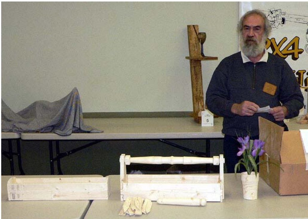
Ted Fromson Garden Toolbox & Tools