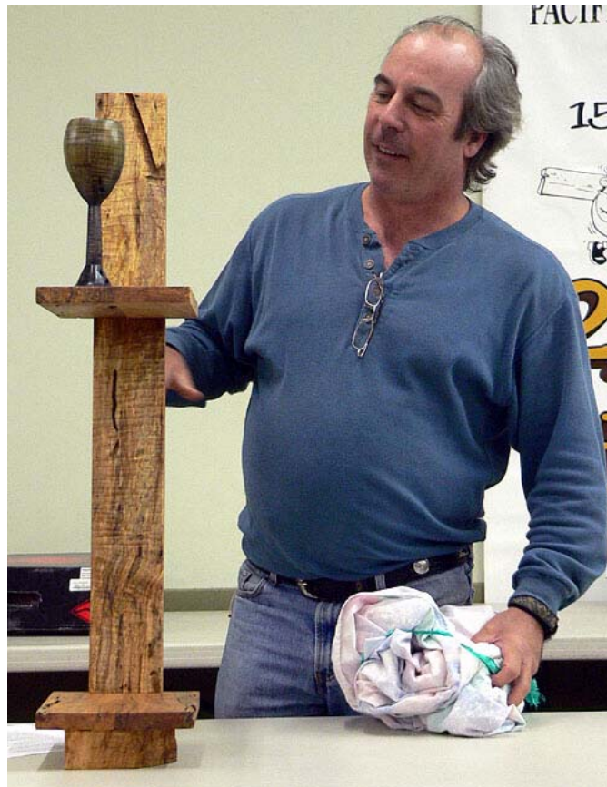
Stuart Mackenzie Wine Glasses & Stand