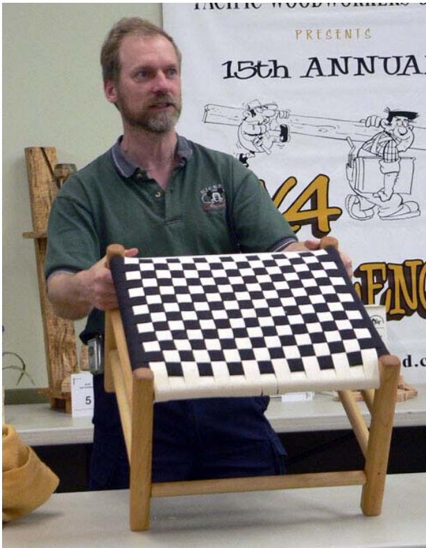
Gordon Bednard Stool